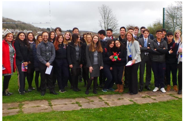
Connecting and collaborating with peers across the Cognita world deepens our learning and builds our global perspective.