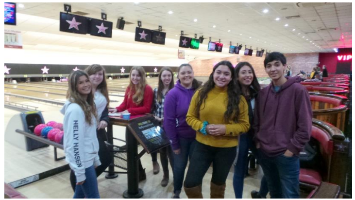
Tenpin bowling in Cardiff with our Chilean visitors.