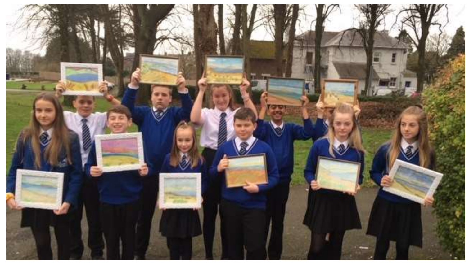
Year 8 have been studying seascapes through multi-media artist Kit Johns.Here are the beautiful watercolours they created this term, framed and ready to go home.

Year 9 have been studying pattern, influenced by portrait artist Gustav Klimt. Each student developed their own printing block and created background patterns to reflect their personalities. They overlaid these with a mixture of self-portraits and portraits of each other to create effective montages. They can be really proud of the results!