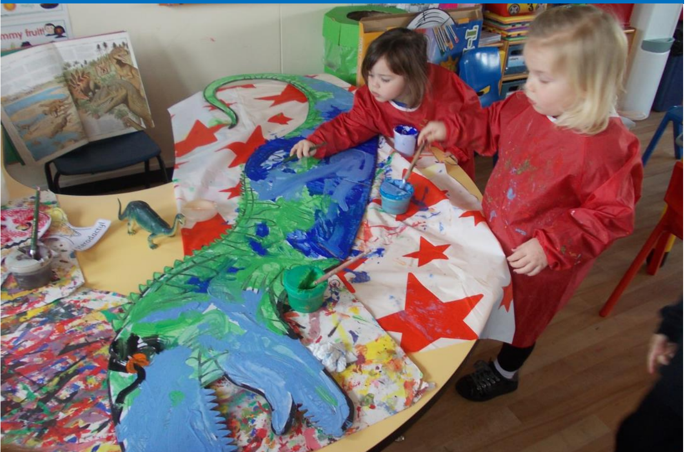
Painting our giant dinosaur!