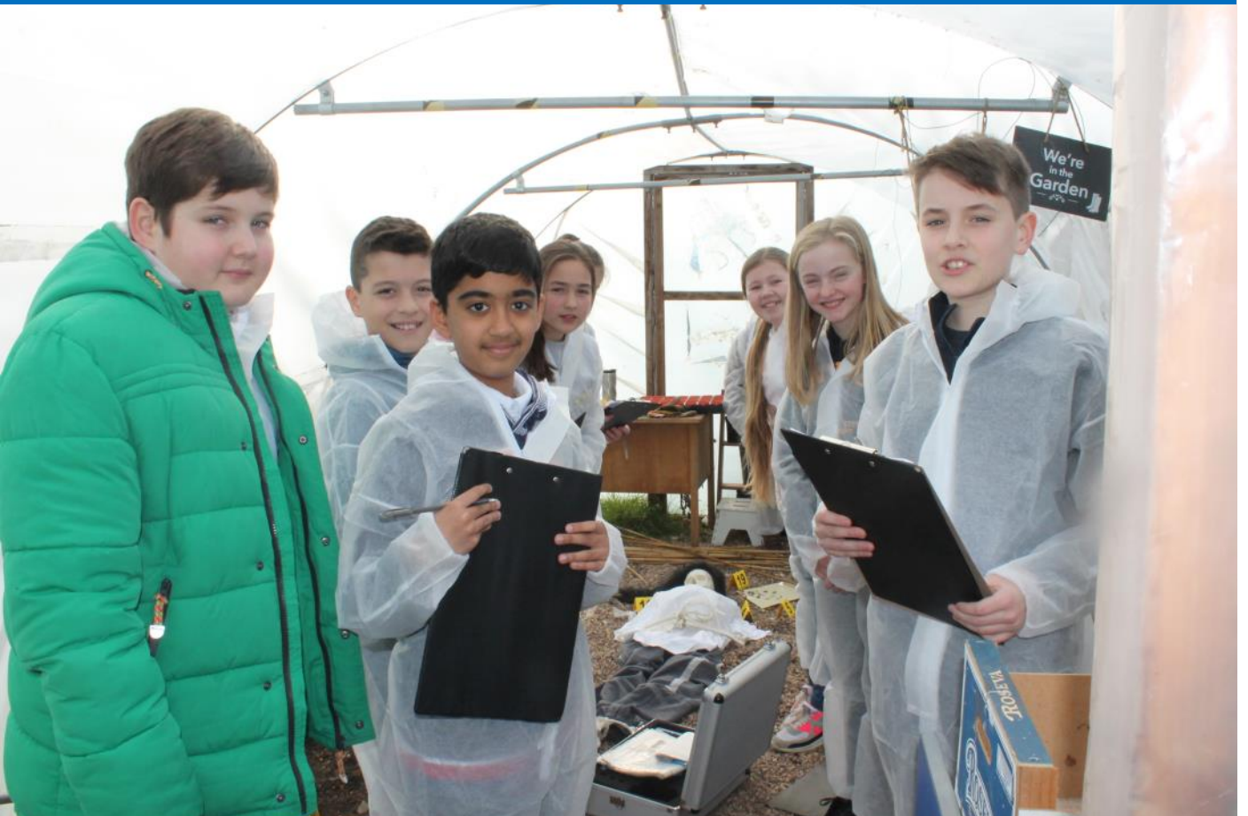
CSI Las Vegas find a skeleton in the polytunnel!