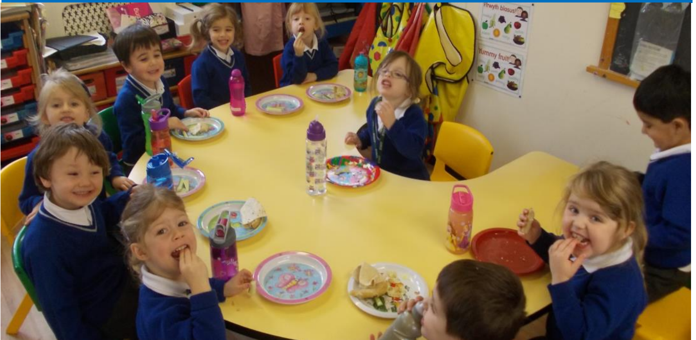
Tasting foods together