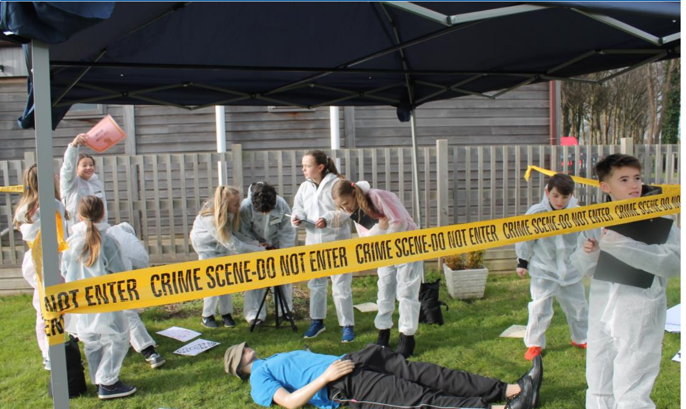
CSI Miami find a clue!