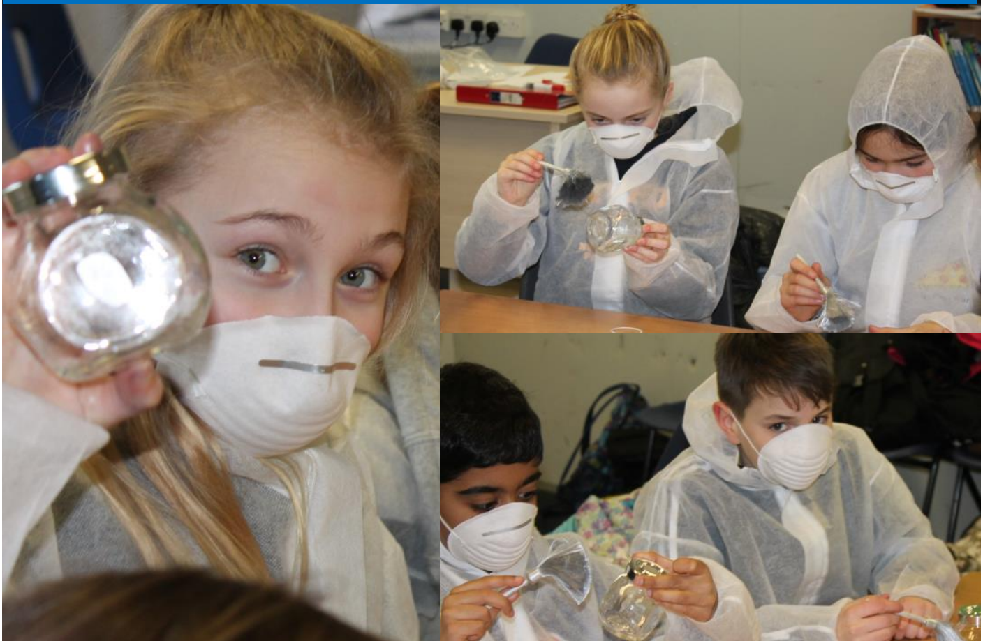
Learning how to dust for fingerprints