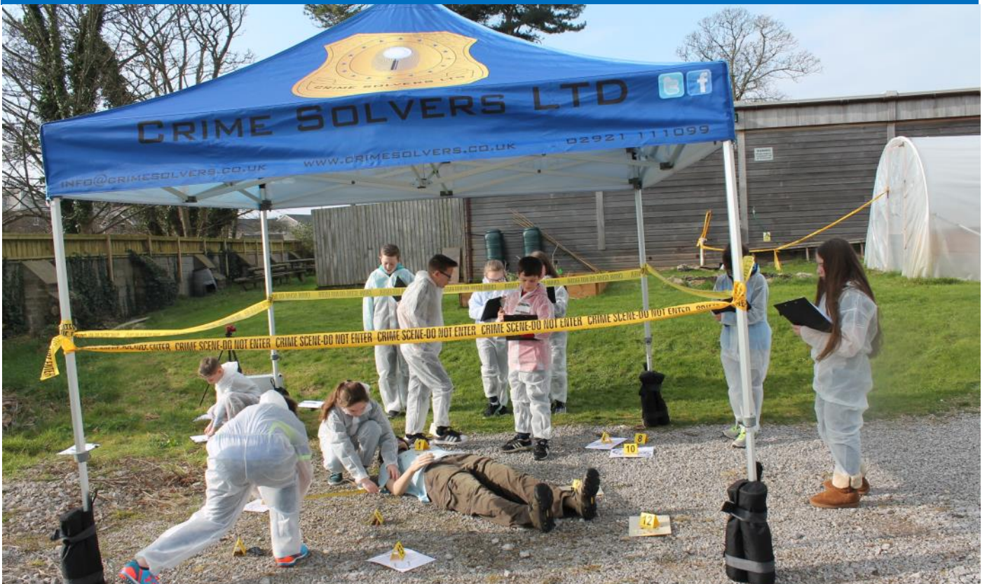
Measuring up and bagging the evidence